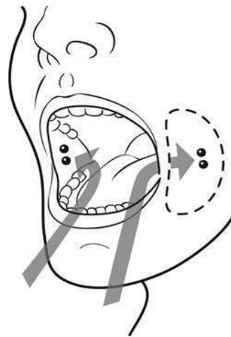
Figure A (2 tablets between your left cheek and gum and 2 tablets between your right cheek and gum).