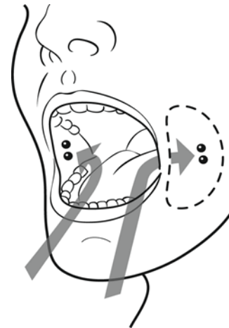
Figure A (2 tablets between your left cheek and gum and 2 tablets between your right cheek and gum).